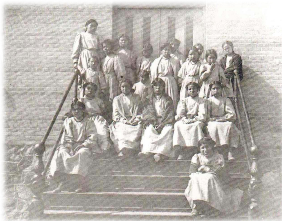
Poplar Boarding School 1912

Total core required general education credits for AS degree 40 credits